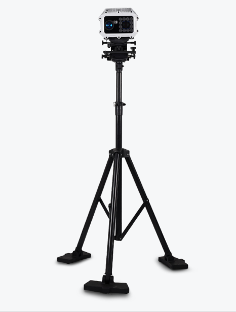
Road Side Tripod (Optional)