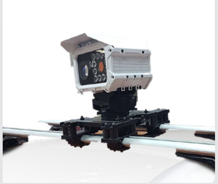
On Roof Bar (Standard)